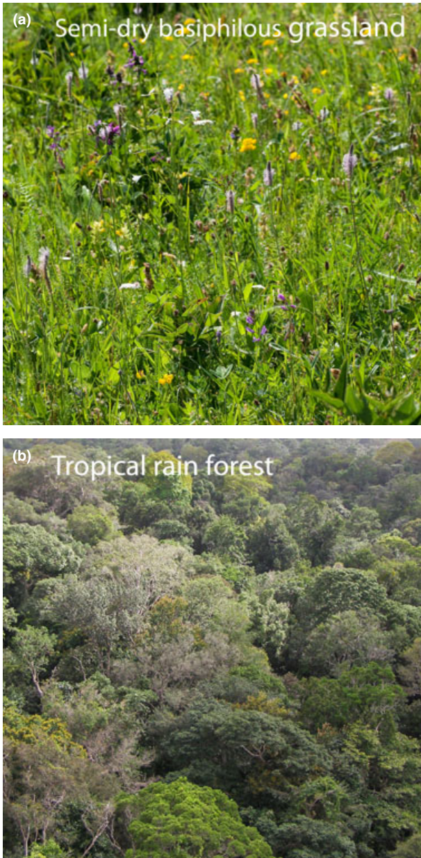
Fig. 1. High-richness community types: (a) Semi-dry basiphilous grassland near Cluj-Napoca, Romania, the site that holds the global richness record at the 0.1- and 10-m 2 scales, and (b) Tropical rain forest in French Guiana, the vegetation type that holds the global richness record at the 100–10 000-m 2 scales.

species–area relations recorded with the shoot presence inevitably have a lower limit. For example, in the study of Dengler et al. (2004) the 9-mm 2 quadrat completely covered the three species hit. The nested 1-mm 2 quadrat therefore also contained three species (Table 1), and a point would also have hit these three. Point quadrat richness is difficult to obtain from the literature because results